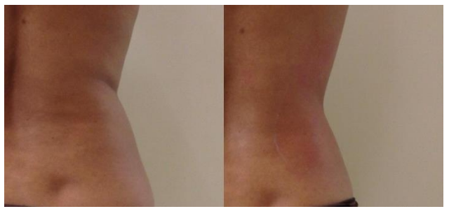
Fig. 2: Combined Er:YAG and Nd:YAG laser treatment of the waist region. Before (left) and immediately after 1 session (right).

During a combined Er:YAG and Nd:YAG laser treatment using thermal pulses, superficial tightening is combined with deep heating of the skin. During the treatment, the generated heat is transmitted through the skin, increasing local vascularization and accelerating organic chemical reactions, including fat metabolism, as well as causing the tightening of deep connective structures (reticular dermis, retinaculum cutis, fasciae). Moreover, superficial tightening using thermal Er:YAG pulses works to improve flaccidity and the surface appearance of the area. With our combined procedure, we were able to achieve immediate and lasting effects (Fig. 2-5). In our experience, an average of 7-8 cm in waist circumference reduction can be achieved. Moreover, ultrasound evaluation showed significant reduction already after 1 session (Fig. 6). However, results varied between patients, with more effects in some and less in others.